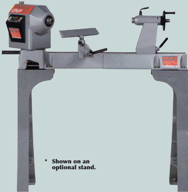
* Shown on an optional stand.